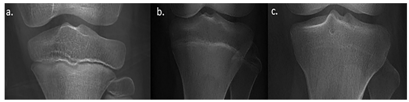
Figure 2. Proksimal tibia epiphysis, a. Grade 1, b. Grade 2, c. Grade 3