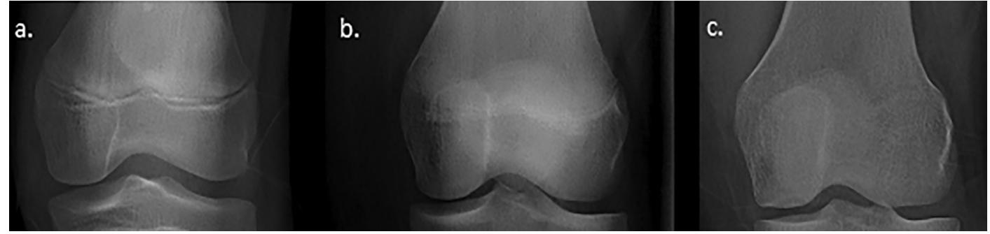
Figure 1. Distal femur epiphysis, a. Grade 1, b. Grade 2, c. Grade 3

The DF, PT, and PF epiphyses of each case were evaluated separately, using the grading system defined by Galić et al. (19). Grade 1: open epiphysis, grade 2: closed epiphysis, epiphyseal scar can be clearly seen, areas adjacent to the epiphysis may not be completely closed, and grade 3: completely ossified epiphysis and the epiphyseal scar can be seen (Figures 1-3).