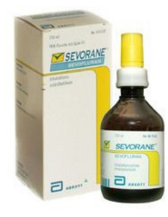
Figure 1. An anesthetic inhalant "sevorane"

In humans, between 2% and 5% of the absorbed sevoflurane dose undergoes metabolic breakdown in the liver. This process leads to the production of inorganic fluoride and the organic fluoride metabolite hexafluoroisopropanol, which is then conjugated with glucuronic acid and quickly excreted via the kidneys. The cytochrome P450 (CYP)2E1 pathway is primarily involved in this biotransformation (3,4).