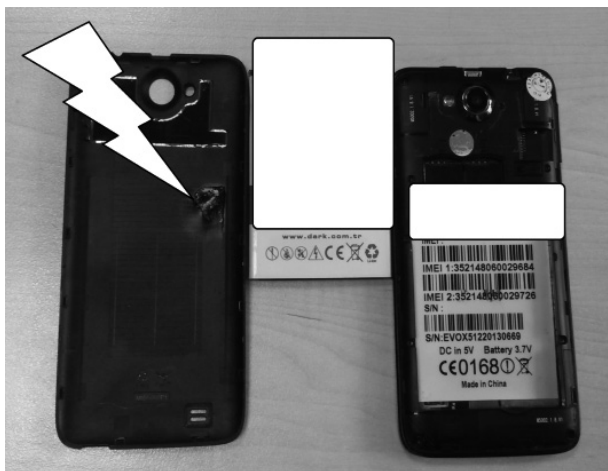
Photograph 1: The plastic part that melts and bulges due to the warming of the mobile phone battery is shown.